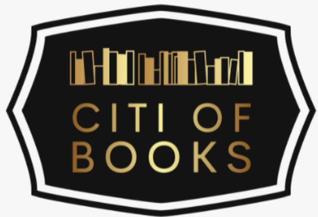
Citi of Books