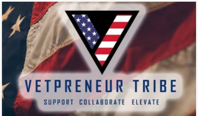
Vetpreneur Tribe Logo

EINPresswire.com/ -- The Vetpreneur Tribe, a thriving online community of over 16,000 veterans from all branches of service, is proud to announce its continued growth and success in providing resources, support, and networking opportunities to help veterans achieve their goals in life and business.