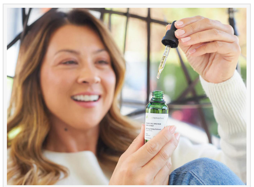
Clean Remedies carries an extensive line of CBD and THC products, including tinctures, gummies, and drink mixes.

AVON, OH, UNITED STATES, December 27, 2024 /EINPresswire.com/ -- As 2024 comes to a close, Clean Remedies, a leader in CBD and THC wellness products, takes a moment to reflect on a year of milestones and express gratitude to its customers. Over the year, Clean Remedies has had a number of successful product launches that have helped individuals and families better their health and wellness.