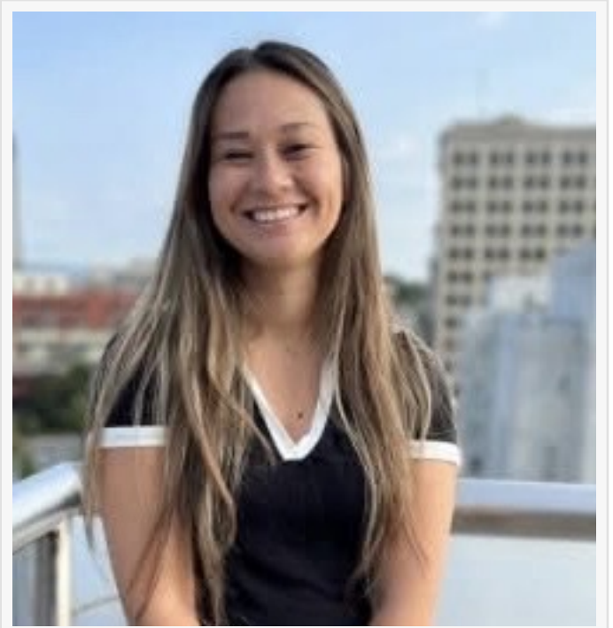
Talent Acquisition Specialist

This press release can be viewed online at: https://www.einpresswire.com/article/772261414