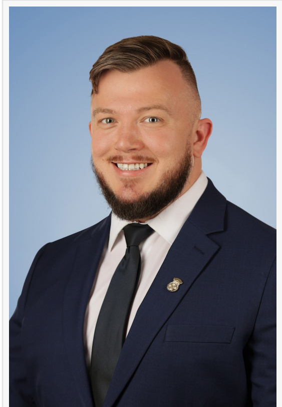
Talent Acquisition Manager