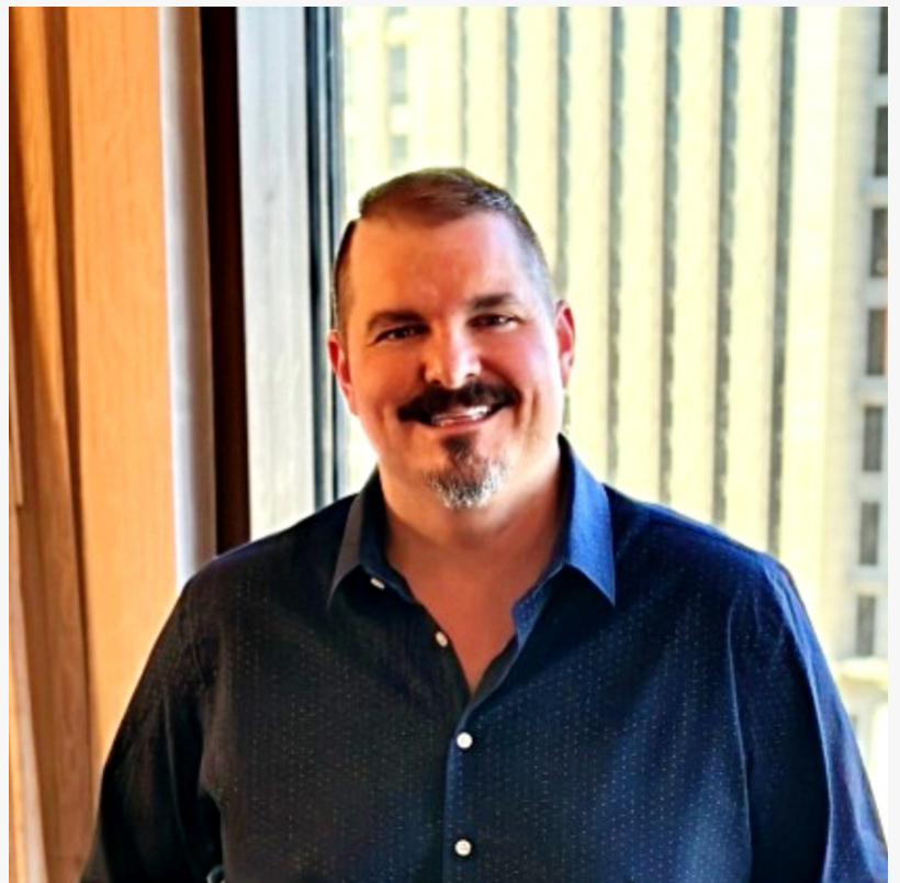
Director of Professional Development and Business Optimization