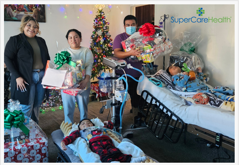
SuperKids Toy Drive Recipients from Children's Hospital Los Angeles

During the holiday season and all year long, SuperCare Health and SuperKids remain committed to increasing access to care and providing the highest quality programs and products to