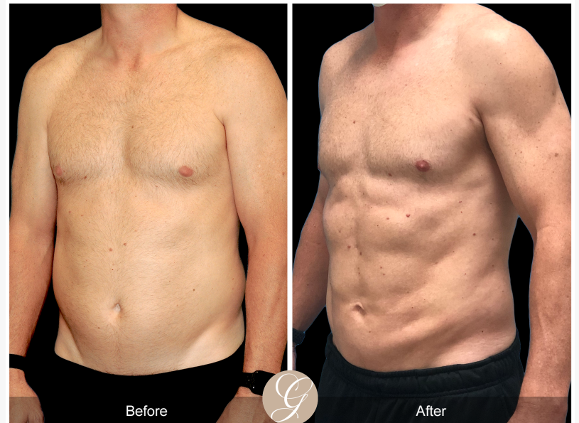
Male Hi-Def Body Contouring using Vaser Liposuction