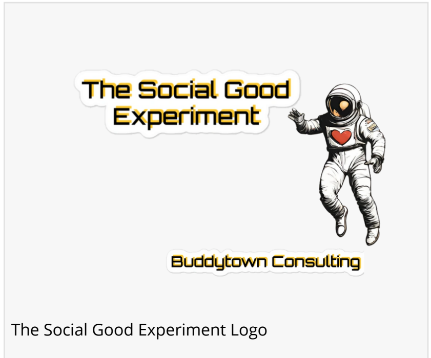
The Social Good Experiment Logo

Buddytown Consulting LLC, a leading advocate for technological and social innovation, proudly announces the launch of The Social Good Experiment 's affiliate program. The Social Good Experiment is a transformative initiative designed to empower healthcare providers and educators with tools and resources for improved patient and student outcomes.