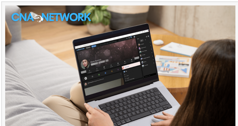
enjoy it on laptop

With its focus on connection and collaboration, CNA.Network provides a unique opportunity for healthcare professionals to find inspiration, share expertise, and navigate the challenges of their field together.