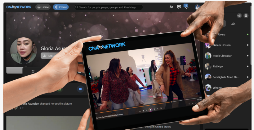
access on any device

Healthcare professionals are invited to join the platform by visiting www.CNA.Network . Registration is quick, and no app download is required.