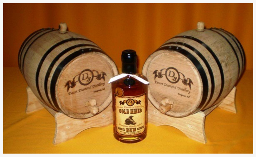
Desert Diamond Distillery Award Winning Rum