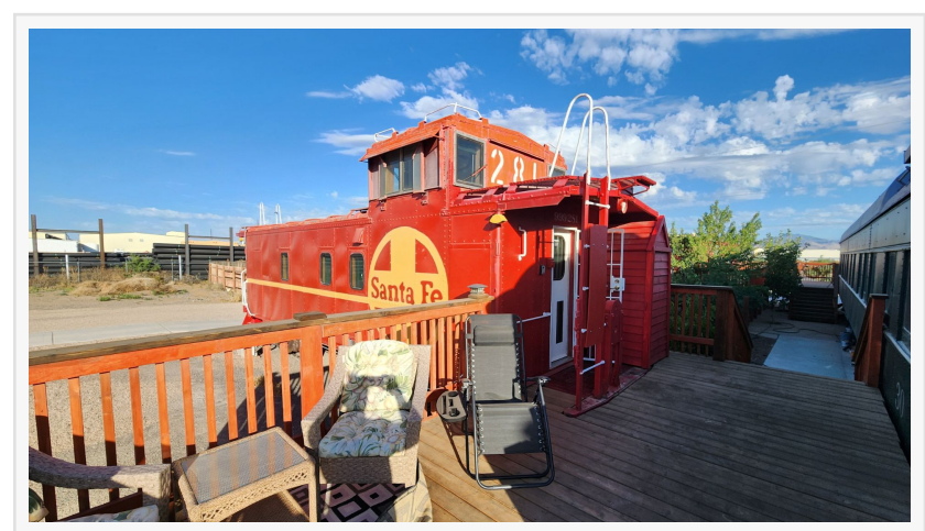
Train Car Caboose

KINGMAN, AZ, UNITED STATES, December 28, 2024 / EINPresswire.com/ -- Desert Diamond Distillery, the award-winning craft spirits producer, today announced the launch of its latest unique accommodation - an <u>Airbnb Train Car</u> experience in Kingman, Arizona.