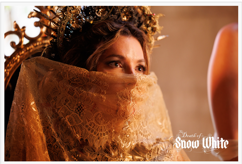
The Evil Queen hides her face after a grotesque beauty practice in the film, the Death of Snow White.