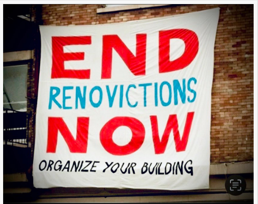
End Renovictions Now

This press release can be viewed online at: https://www.einpresswire.com/article/772671901