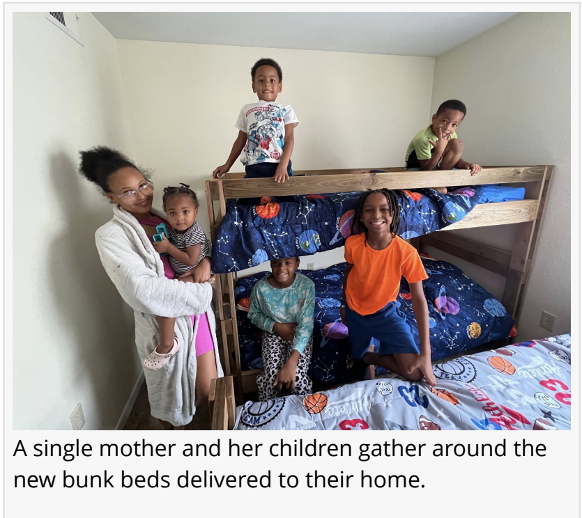
A single mother and her children gather around the new bunk beds delivered to their home.