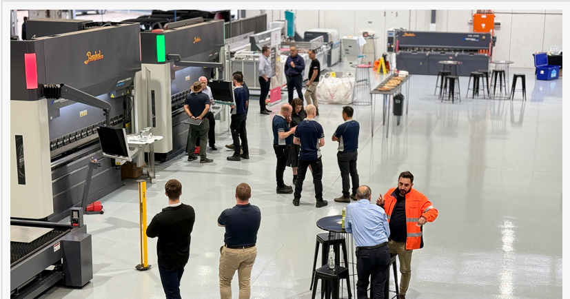
Recent CNC machinery demonstration centre event