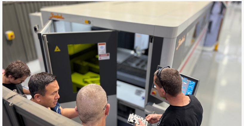
Discussing the capabilities of a new CNC Fibre Laser Cutting Machine