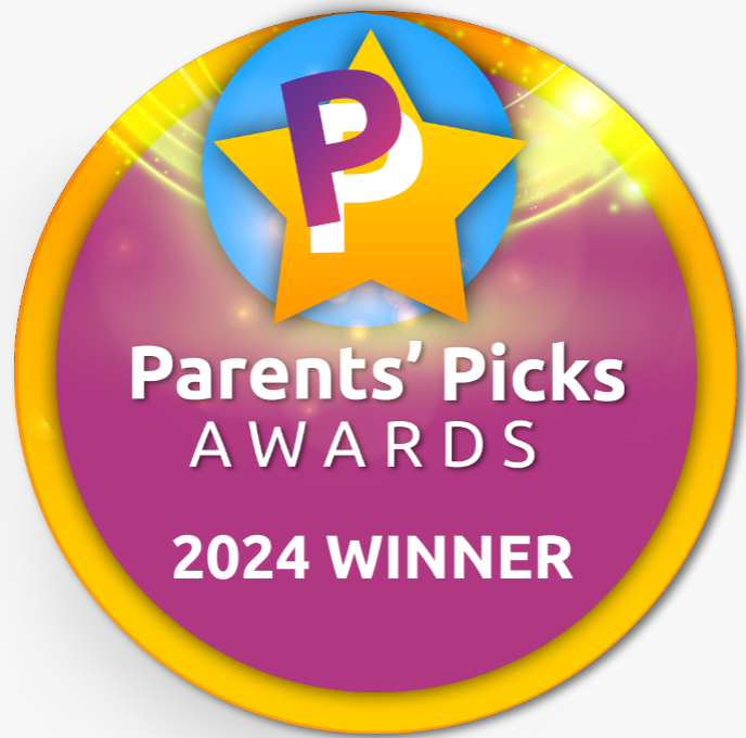
Parents' Picks Award seal to Tum&Bum

In recognition of its exceptional design and functionality, Tum&Bum also received the Mom's