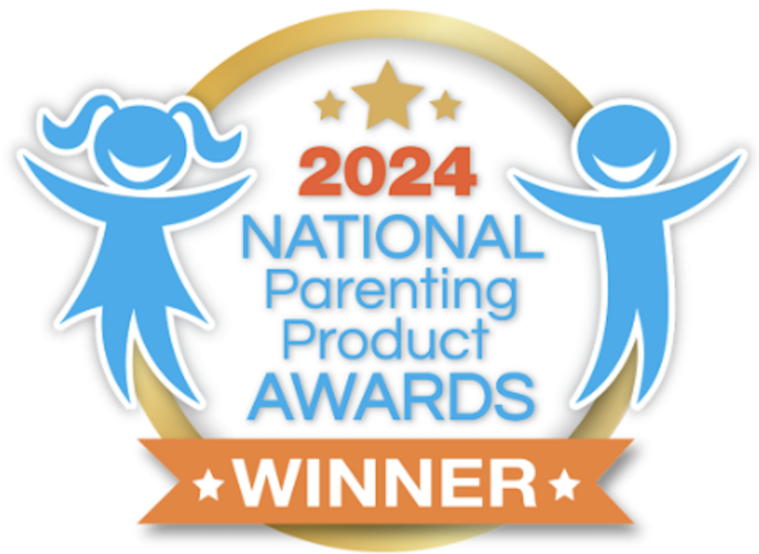
National Parenting Product Awards (NAPPA) seal awarded to Tum&Bum.