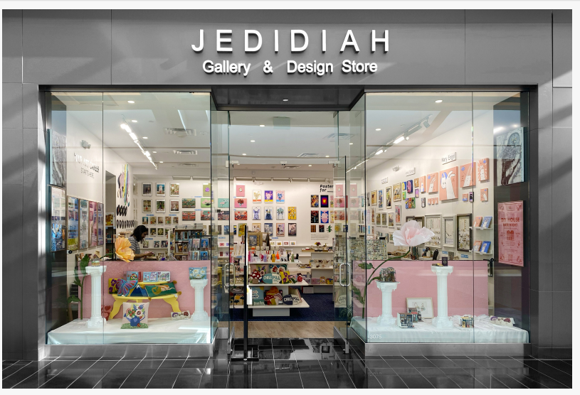
Jedidiah Gallery & Design Store Front in King of Prussia Mall

The progressive and innovative Jedidiah Gallery takes pride in appealing to Millennial and Gen Z