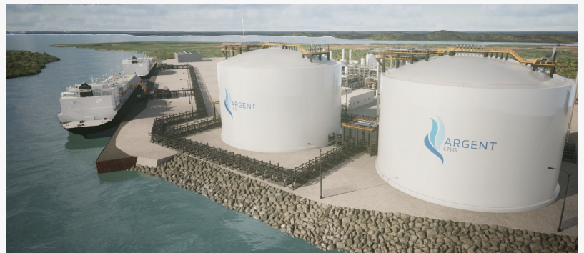
GTT Cryogenic Membrane LNG Containment Tanks