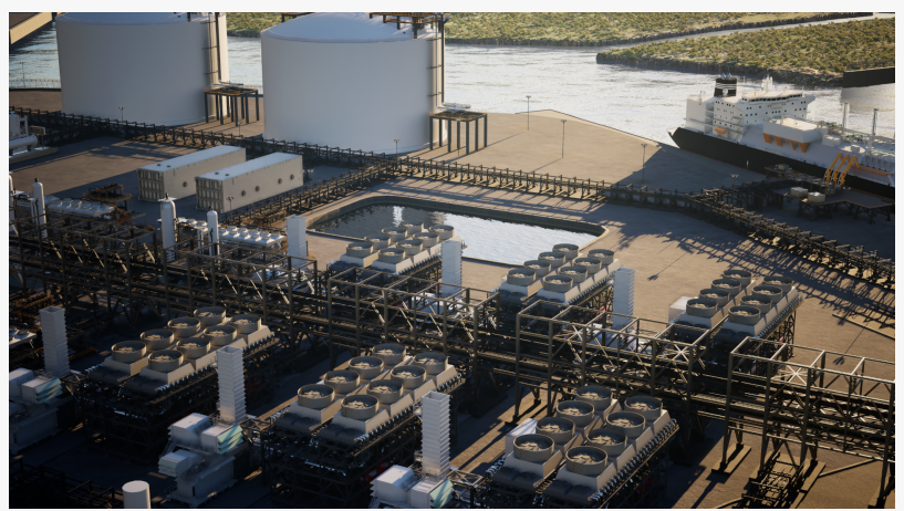
Argent LNG 6 Trains and Dock

The video, available for viewing https://youtu.be/2t8q5z8pbk4 , captures the essence of ARGENT LNG's vision and mission. It vividly demonstrates the transformative potential of clean energy innovation and the importance of a collective effort in building a sustainable and equitable