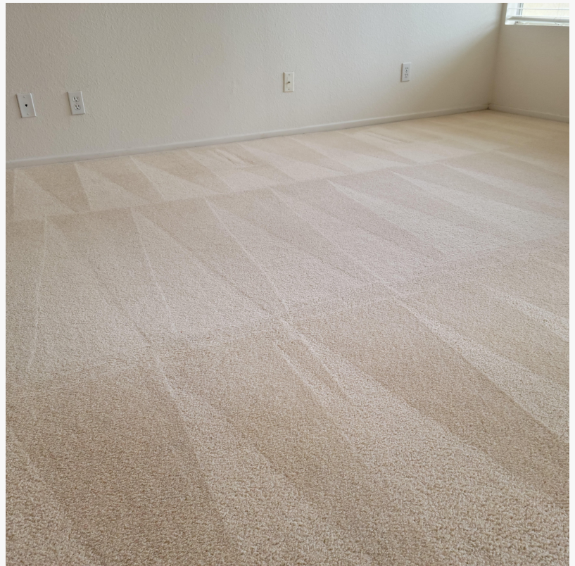
Eco-Friendly Carpet Cleaning Services Provided By JP Carpet Cleaning