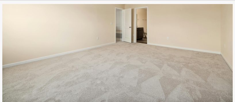
Porter Ranch Carpet Cleaning

Carpets are more than just a design feature in a home; they serve as essential filters, trapping dust, allergens, and pollutants to maintain cleaner indoor air. However, without regular cleaning, carpets can become reservoirs for these irritants, negatively impacting air quality and health. This is why professional carpet cleaning is a crucial part of home maintenance.