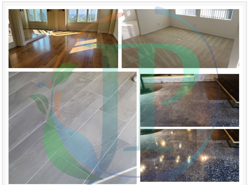
Services JP Carpet Cleaning

As a family-owned business, JP Carpet Cleaning Expert Floor Care places a high value on