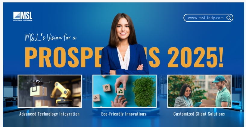
MSL's Vision For 2025