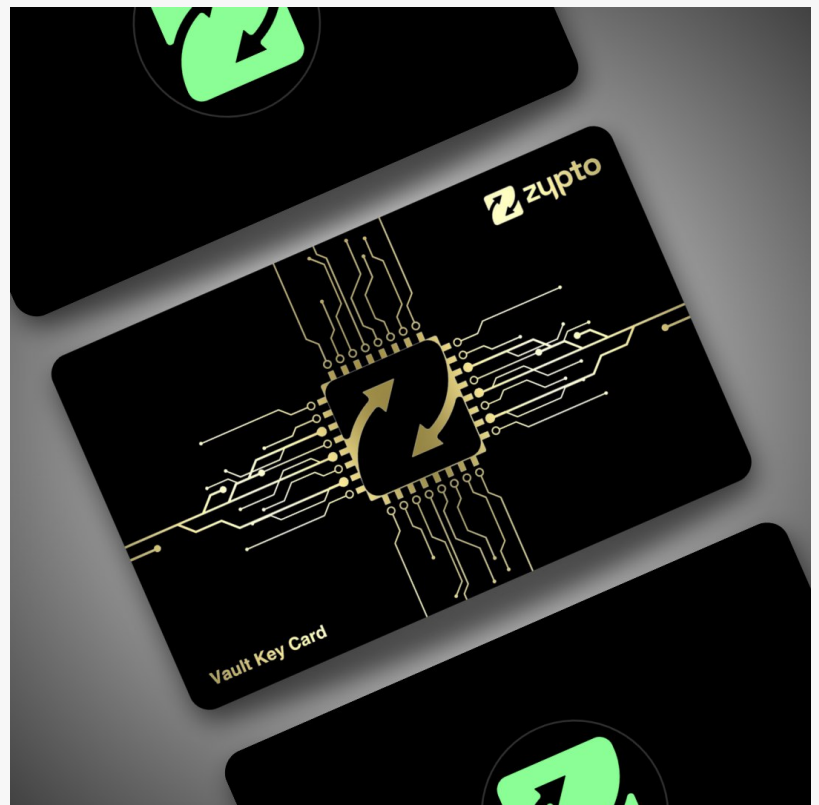
Zypto Hardware Wallet Solution

While hardware wallets from companies such as Ledger, Trezor, and others have set the bar for