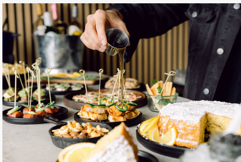
5850 Fest - Summit to Table