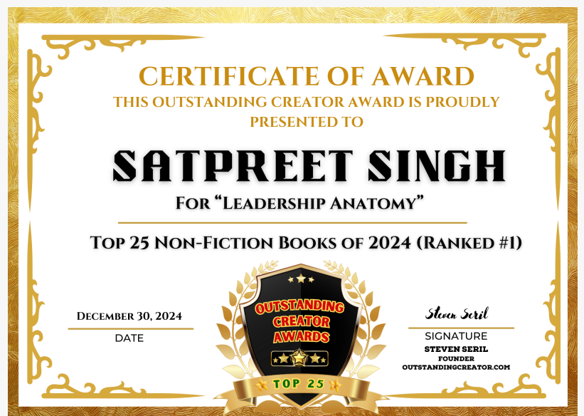
Ranked #1 Top 25 Award for Non-Fiction Book