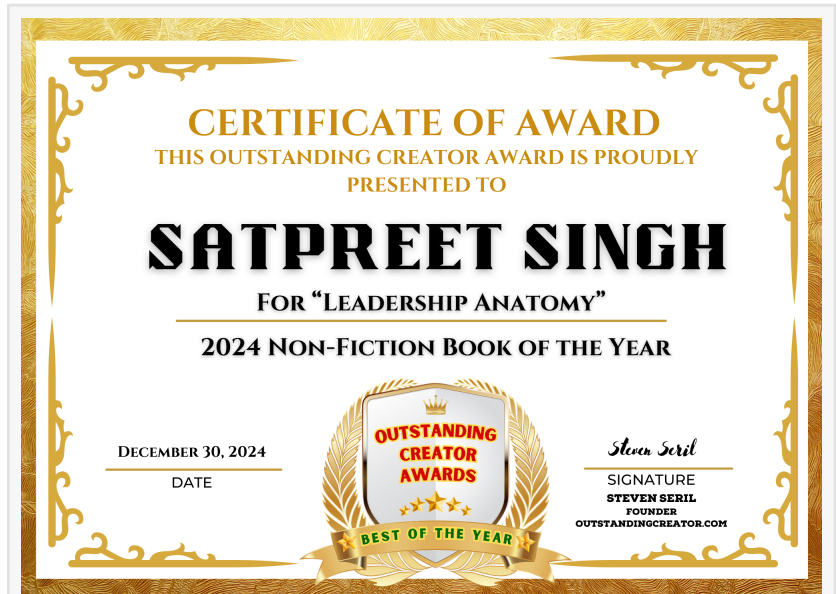
Non-Fiction Best Book of the year 2024 award