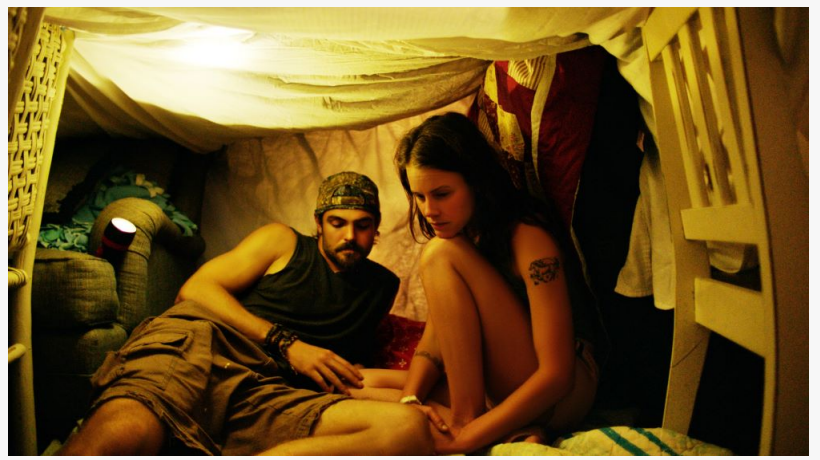
Still from the movie

The filmmakers and local recovery groups will appear at select screenings throughout Appalachia after the credits roll for a series of unfiltered, no-holds-barred Q&A sessions to discuss the film and the area's ongoing battle with addiction and its impacts.