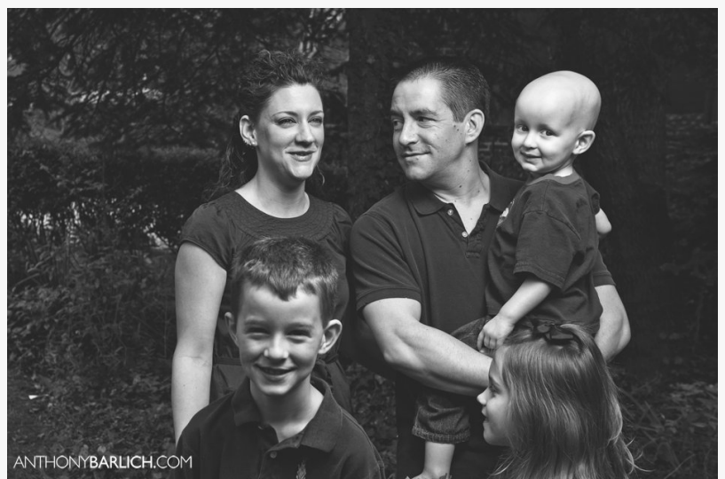
The Mitlo Family