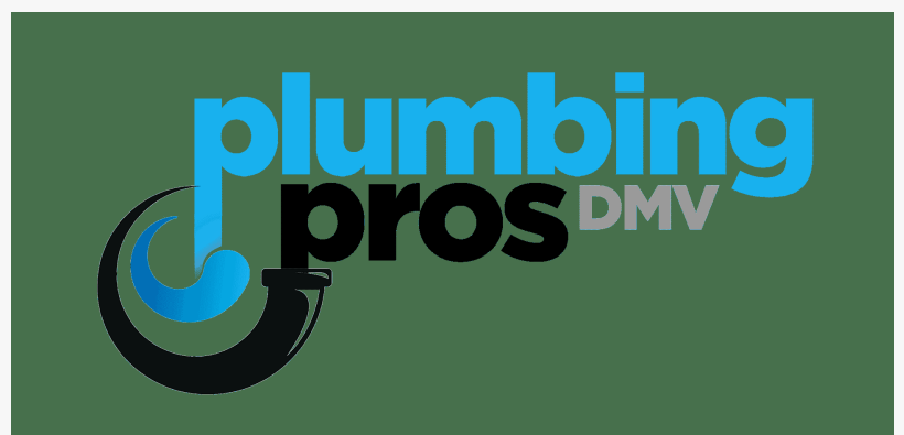
Plumbing Pros DMV

Gas lines play a vital role in supplying fuel to a variety of appliances, including water heaters,