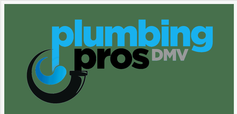
plumber germantown md

Officials overseeing building maintenance in the DMV region have expressed concern about the prevalence of water leaks stemming from improperly installed lines or malfunctioning ice maker connections. Reports of property damage due to undetected leaks have prompted homeowners' associations and commercial operators to seek professional services capable of ensuring that these critical plumbing connections remain secure, efficient, and code-compliant. Plumbing Pros DMV's expanded offerings aim to respond to this need by employing established industry