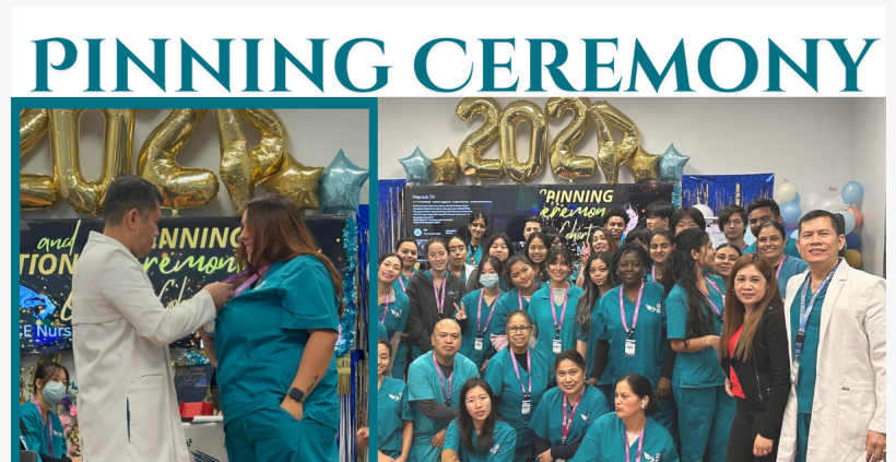
CNA School Near Me