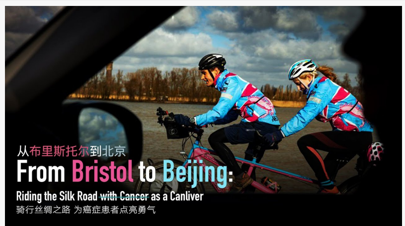
'From Bristol to Beijing' - The Award Winning Short Film

The Bridge Builders series added to its prestigious record with two new awards from the Academy of Interactive and Visual Arts (AIVA) in 2024. Another series to be recognized at the organization's W3 Awards was China Explained which explores and unwraps contemporary fashion, life, technology and culture.