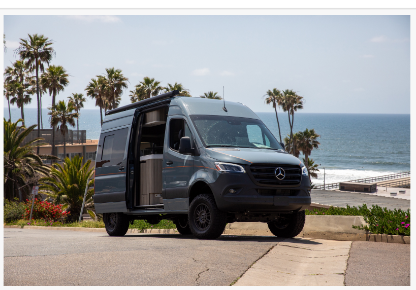
San Diego 595L 1 Roadtrip

From Yachts to CampersInnova began as a supplier for yacht builders in the Netherlands, crafting high-quality components for luxury vessels. Over time, the company shifted its focus solely to offering luxury yacht-inspired campers built on the reliable Mercedes-Benz Sprinter platform. This evolution reflects Innova's dedication to delivering the same elegance and functionality found in premium yachts to the world of road travel.