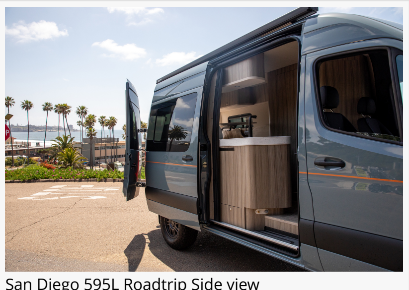
San Diego 595L Roadtrip Side view

Luxury Shower: A modern bathroom featuring a high-end shower for comfort on the go and a Clesana Dryflush Non Chemical toilet