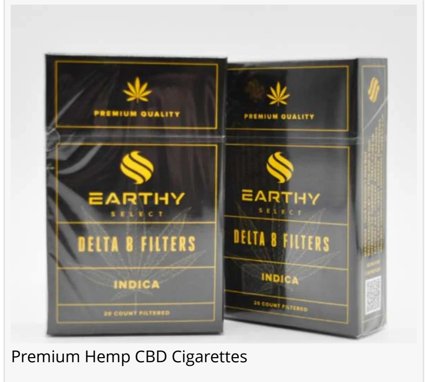
Premium Hemp CBD Cigarettes