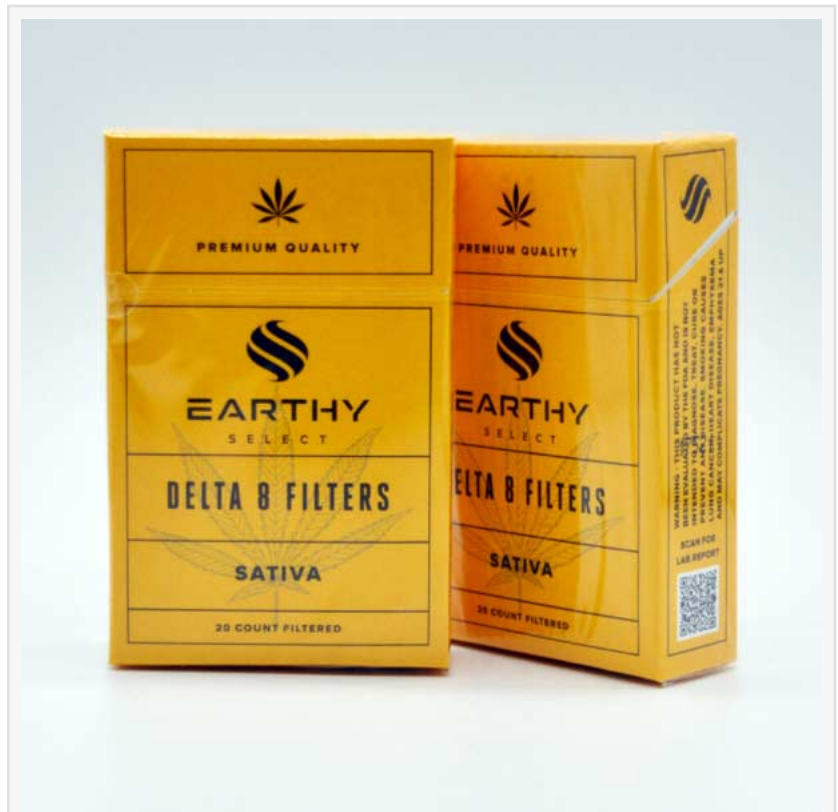
Hemp CBD Cigarettes