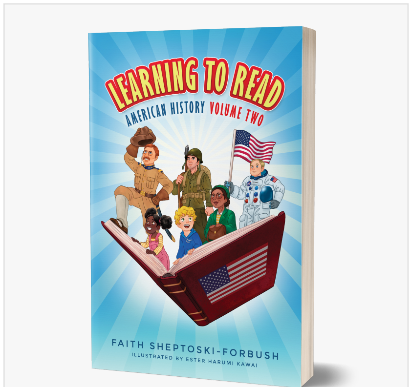
Learning to Read: American History Volume 2 (3-D)