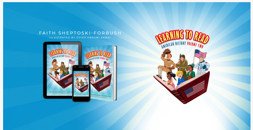
Learning to Read: American History Volume 2 Banner