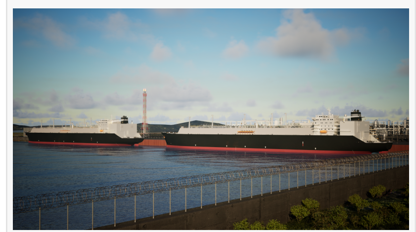
Argent LNG Ships