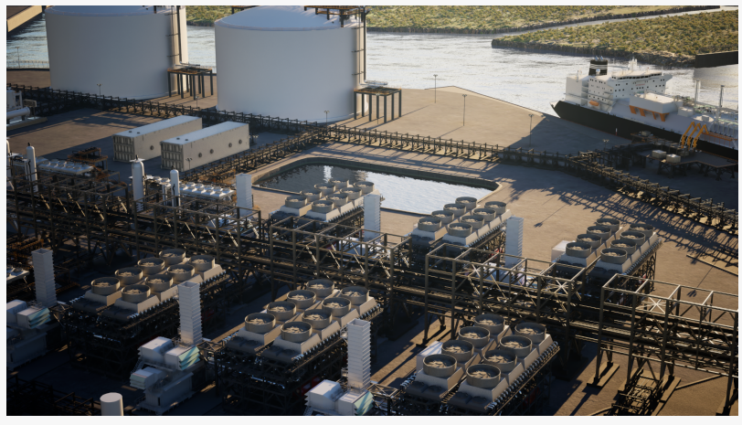
Argent 6 Trains Loading LNG Carrier

traffic and the ability to move molecules quicker and more efficiently to the customers."