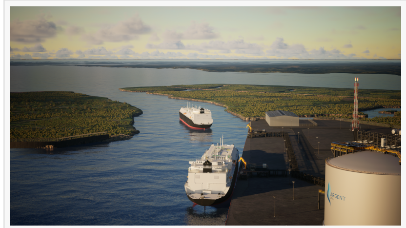
Argent Ship Leaving Dock

This development underscores Argent LNG's commitment to meeting global energy needs while fostering innovation and sustainability. By utilizing Port Fourchon, the company aims to reinforce its role as a leader in the global LNG market, delivering cleaner, more efficient energy solutions.