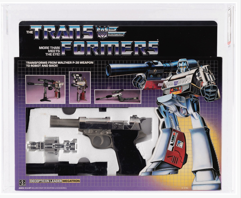
Hasbro Transformers (1984) Series 1 Megatron (Decepticon Leader), AFA 80 NM. Mint, sealed box. Only 2 examples known in AFA 80 grade, per AFA Population Report. First with intact tape seals ever offered by Hake's. Estimate: $10,000-$20,000