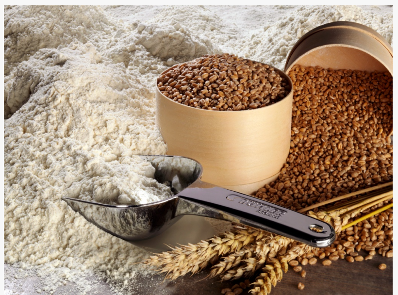
Quality flour produced on Bühler machines, beside wheat kernels

SPARK Pro is Bühler's new generation optical sorter, combining solid performance, reliability and ease of use. Equipped with newly developed high-definition full colour cameras and a full spectrum LED lighting system, SPARK Pro detects even the slightest in colour variations and imperfections and sorts out the common defects and alkaloids in wheat. The advanced machine can detect and successfully eject all visible and invisible defects down to a size of only 0.0025mm 2 .