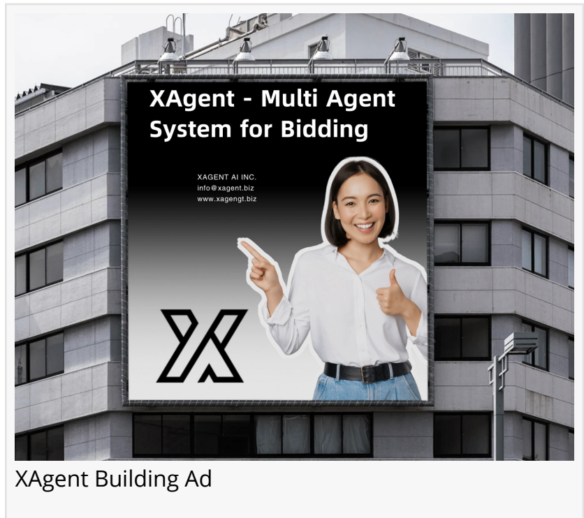
XAgent Building Ad