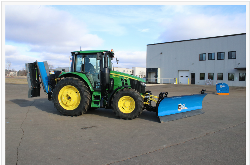
This 1200 Series Under-Hitch allows from both front and back blade snow plows on the same tractor.

This press release can be viewed online at: https://www.einpresswire.com/article/773882707