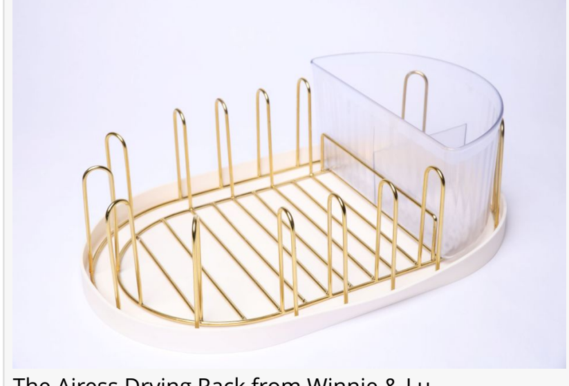
The Airess Drying Rack from Winnie & Lu