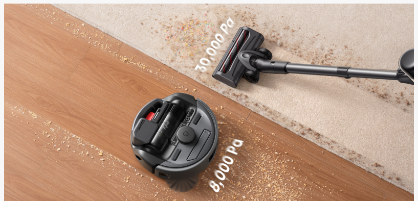
Eufy E20 RoboVac cleaning width suction image