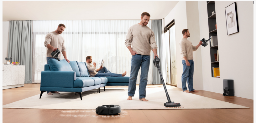
E20 3-in-1 RoboVac Lifestyle Image