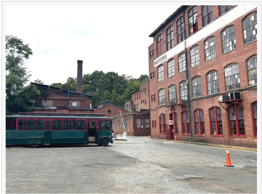
Great Falls Industrial Park

PATERSON, NJ, UNITED STATES, January 4, 2025 /EINPresswire.com/ -- The Art Factory - Paterson , New Jersey's renowned creative hub that has inspired countless artists, musicians, and creators - will be offered in an online auction concluding January 30, 2025 by Max Spann Real Estate & Auction Company . Only 12 miles from New York City and minutes from Interstate 80, the 230,000 Sq ft, 21-building Great Falls industrial Park