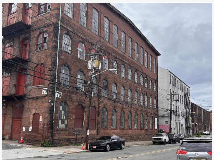
230,000+/- SF Commercial, Industrial, Film Studio Space