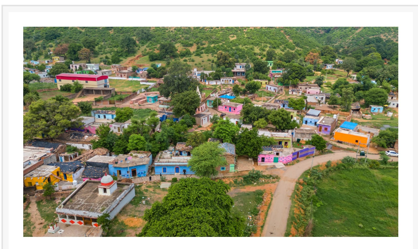
Best Tourism Village - Pranpur Craft Handloom Tourism Village

In a momentous achievement, 11 destinations within the state were included on UNESCO's tentative list of World Heritage Sites. This recognition underscores Madhya Pradesh's vast cultural and historical assets and paves the way for potential UNESCO World Heritage status in the future.