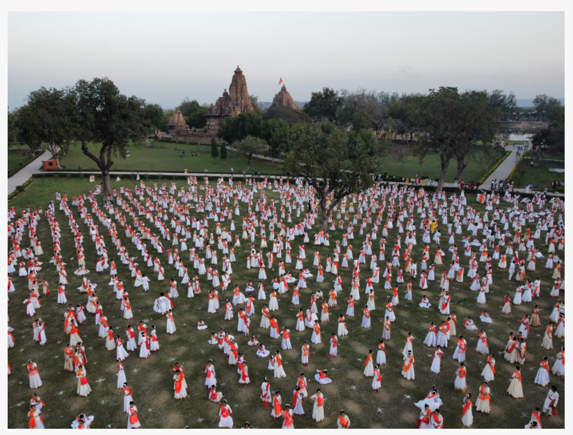
Guinness World Record of Kathak Performance