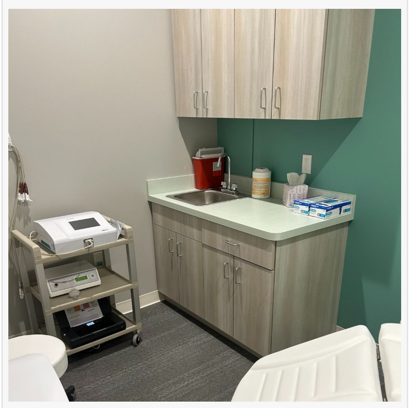
Exam Room Medi Weightloss Canton