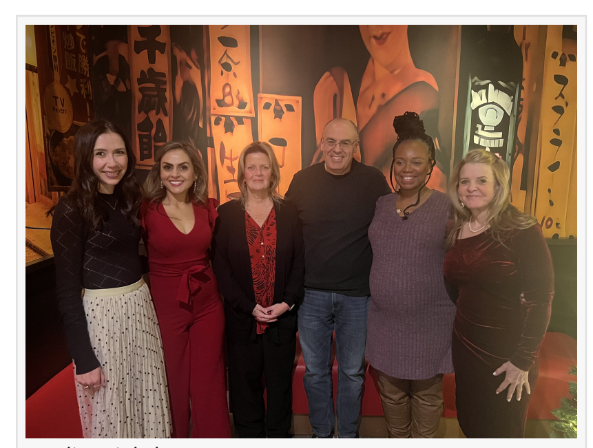
Medi Weightloss Canton Team

CANTON, MI, UNITED STATES, January 7, 2025 /EINPresswire.com/ -- Medically-supervised, evidence-based weight loss clinic Medi-Weightloss® of Canton is proud to announce its 1st Anniversary of opening at 5816 North Sheldon Road Canton, MI 48187. In celebration of this milestone, the clinic is excited to announce that it is now offering the latest GLP-1 weight loss medications in its clinic, and is now accepting most major health insurance plans.