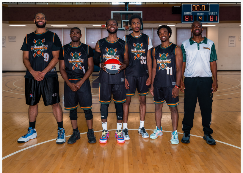
Southwest Warriors ABA Basketball Team

STEM Pioneers and Visionaries: A Compendium of African American Innovators and Inventors in Science, Technology, Engineering, and Mathematics