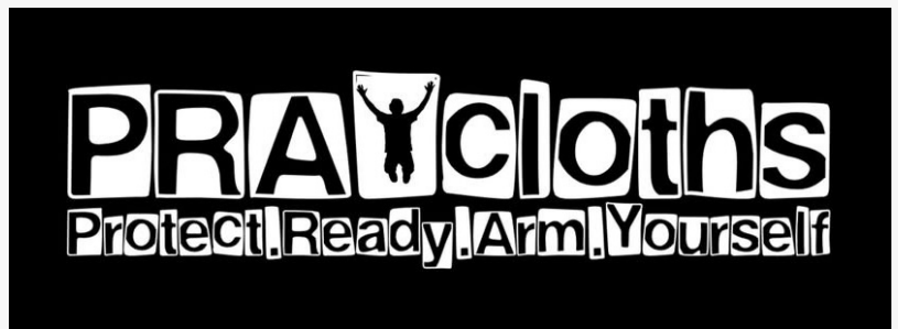
Pc Acronym Meaning

This press release can be viewed online at: https://www.einpresswire.com/article/774302706