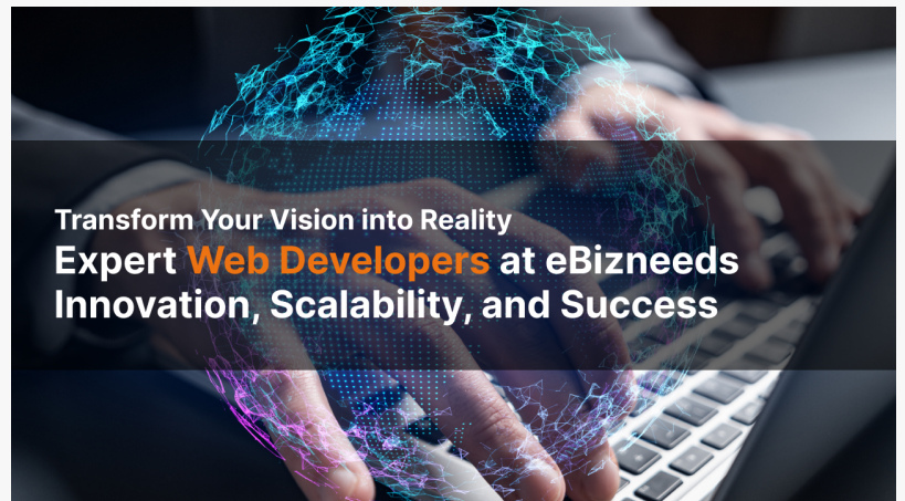
Transform Your Vision into Reality