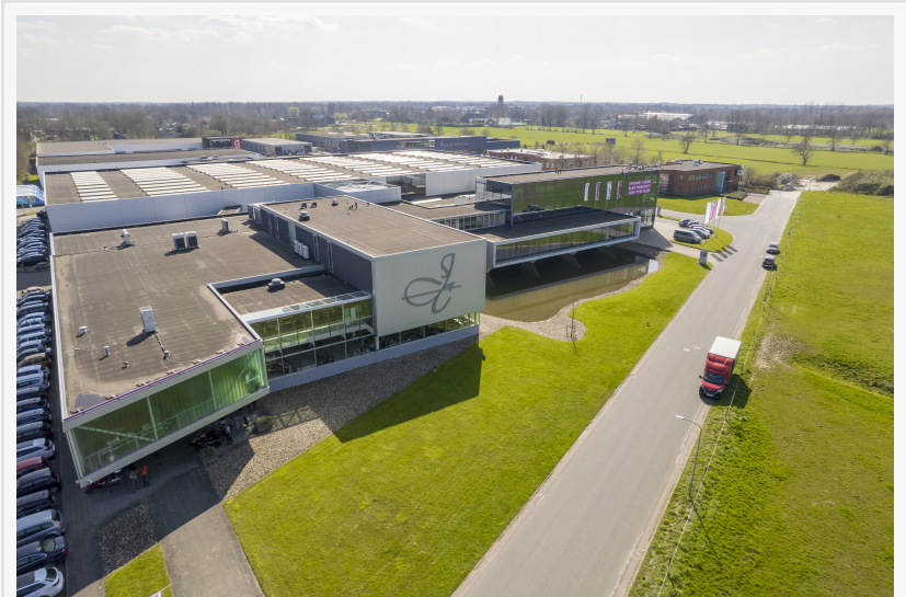
The JC-Electronics Group headquarters in Leek, Netherlands

SPRINGFIELD, PA, PA, UNITED STATES, January 7, 2025 /EINPresswire.com/ -- DAX Automation, Inc., trusted supplier of hard-to-find and obsolete automation parts and industrial electronics, has rebranded to JC-Electronics , Inc. and now provides its US customers with access to a much broader stock of over 300,000 new or fully reconditioned components.