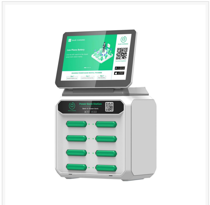
Counter Top Power Bank Station

By partnering or sponsoring Watts Up Recharges , your brand can be part of this innovative solution from its early stages, gaining visibility in a rapidly growing market. Partners will benefit from association with a modern, high-visibility service that enhances the visitor experience, promotes local businesses, and increases engagement with target audiences in key tourist destinations. These limited opportunities ensure that businesses involved now will have a prominent presence as the network grows across North America.