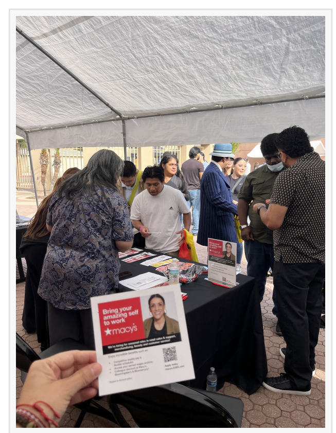
El Clasificado organizes Job Fair for Spanish Speaking applicants

Tailored for Spanish Speakers: Every participating company will have Spanish-speaking representatives, ensuring effective communication and a comfortable experience for attendees.