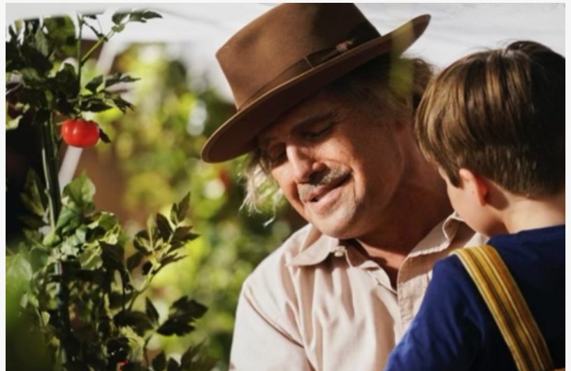
Billy Zane portraying Marlon Brando in his newest film, "Waltzing with Brando" receiving the Artistic Achievement Award at the Tahoe Film Festival