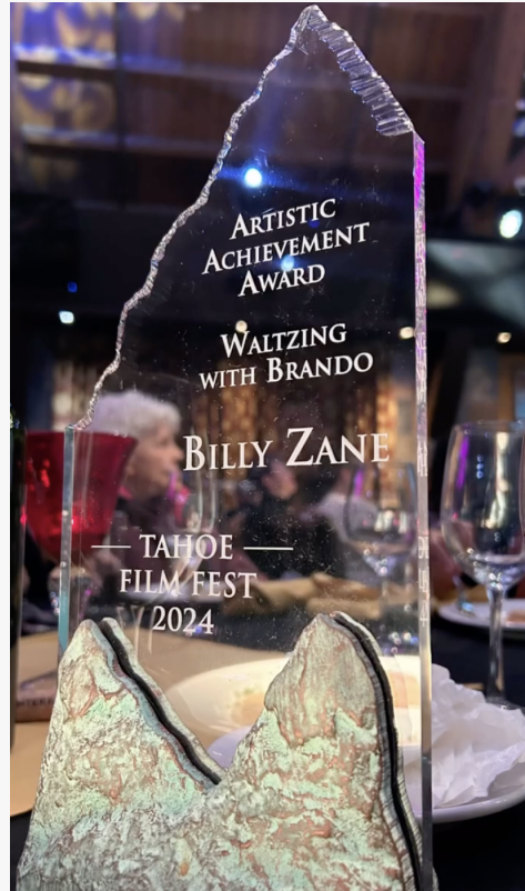
Billy Zane receiving the Artistic Achievement Award for his newest film, "Waltzing with Brando" at the Tahoe Film Festival