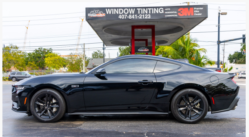
Dark Window Tint Installed on a Ford Mustang GT - Pro Tint of Orlando