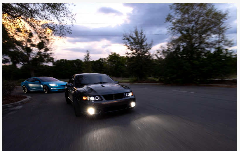
Key Updates to Florida's Window Tint Laws for 2025

"Generally, primary offenses mean that you can get pulled over for that action alone, like speeding or running a red light. While a secondary offense can only be cited by an officer after