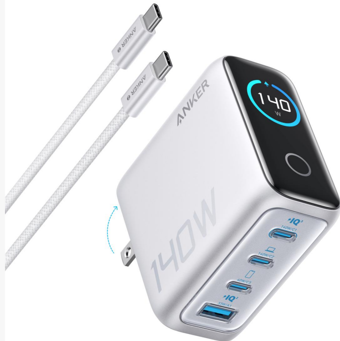
Anker Charger (140W) with display