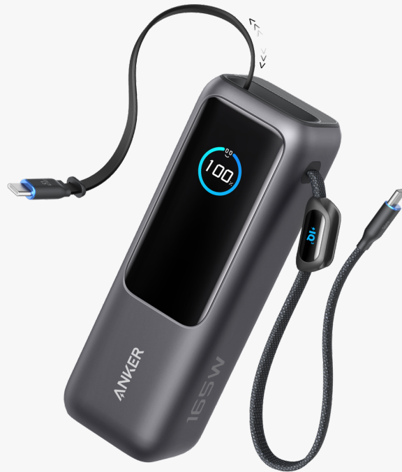
Anker Power Bank (25K, 165W, Built-In and Retractable Cables)

With an IP67 waterproof rating offering excellent durability, the umbrella's sunshade fabric,