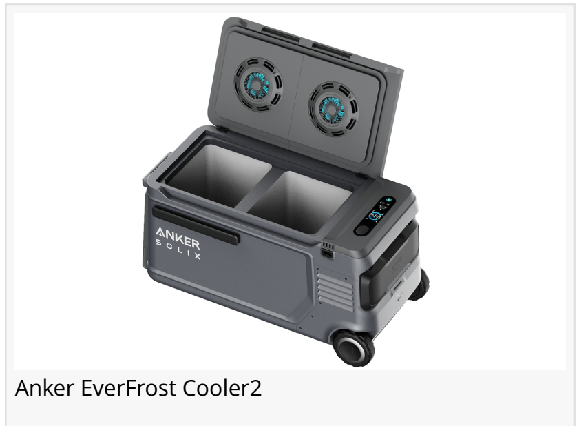
Anker EverFrost Cooler2

The EverFrost electric cooler and Anker charger and power bank, along with the newly released Anker MagGo lineup or Anker SOLIX C300 series, will also be showcased at the booth -- Hall