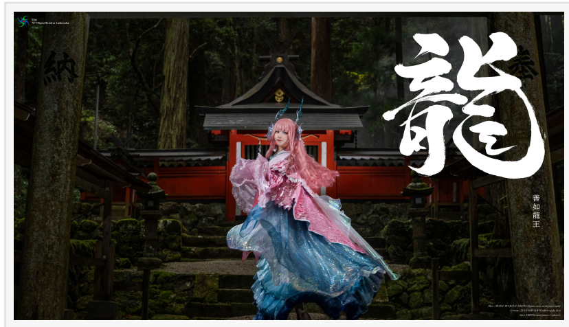
"ZEN-NYO-RYU-OU" is a female deity who rules over the sky.

https://opensea.io/assets/ethereum/0x 8ab524ee78876facb30007b974e3fd5a 396166a7/0